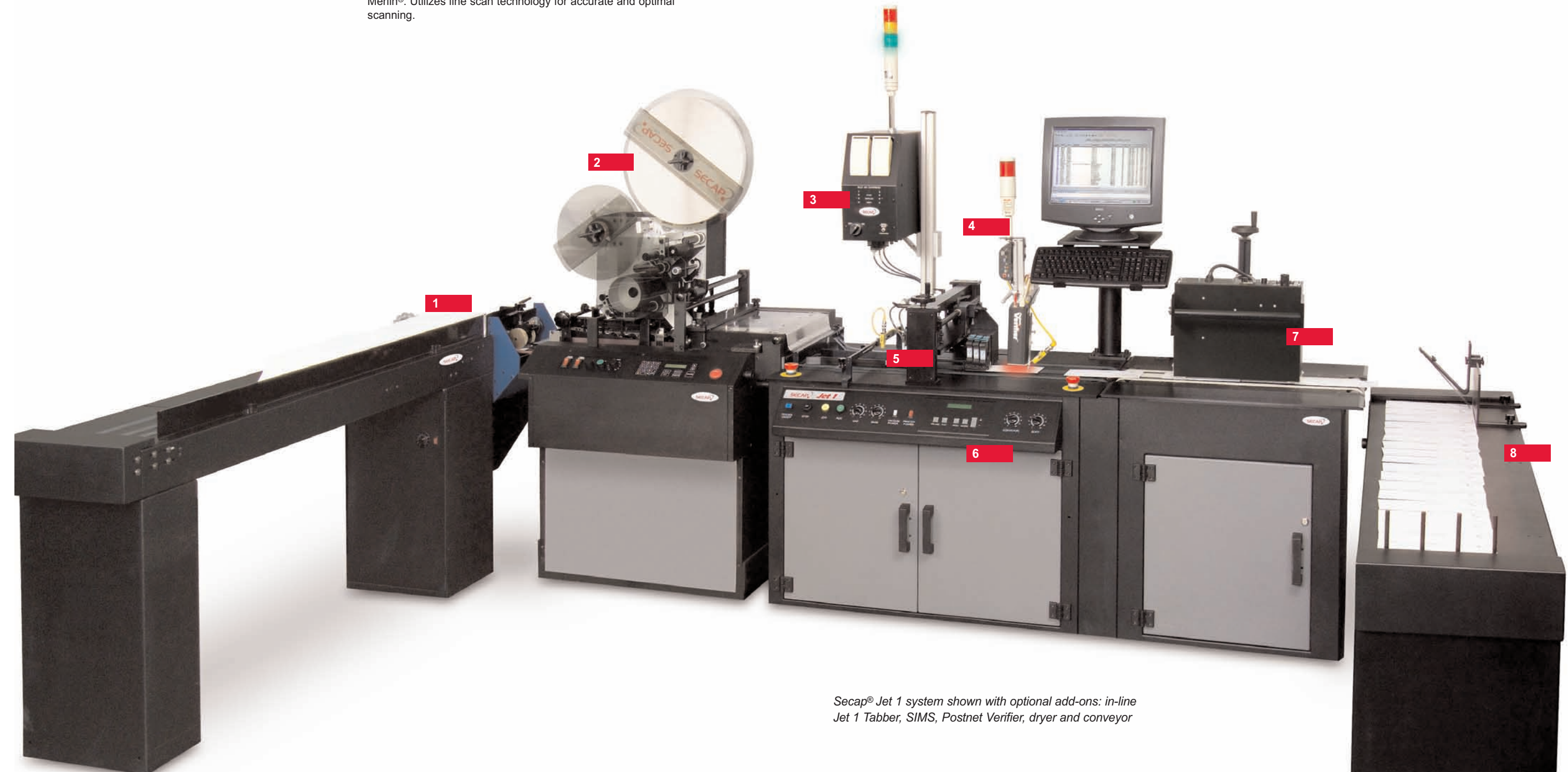
Secap® Jet 1 system shown with optional add-ons: in-line Jet 1 Tabber, SIMS, Postnet Verifier, dryer and conveyor