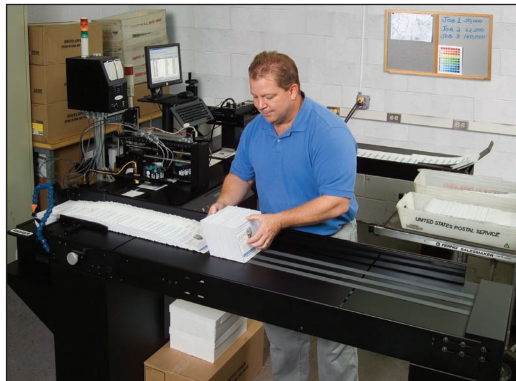
The UltraFeed™ high capacity feeder provides consistent and even feeding of media, moving high-volume jobs along faster for increased mailstream productivity.

High quality, flexible configurations, increased production and productivity, the ability to run both in-line and off-line, and superior imaging and print quality are some of the reasons why the Jet 1 system is the perfect solution for your mailing needs. It's an investment that pays for itself.